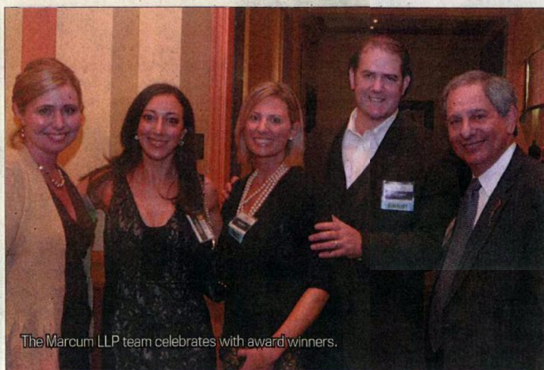
The Marcum LLP team celebrates with award winners.