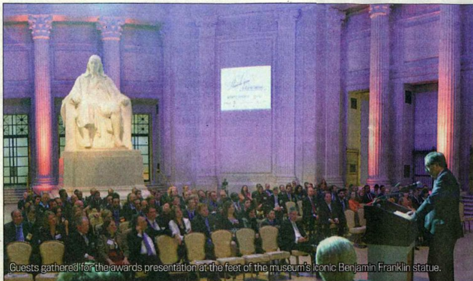
Guests gathered for the awards presentation at the feet of the museum's iconic Benjamin Franklin statue.